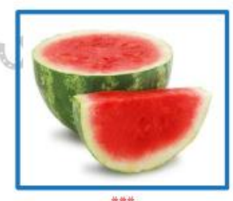
Watermelon Seedless 980-6180 | 1/1 ct