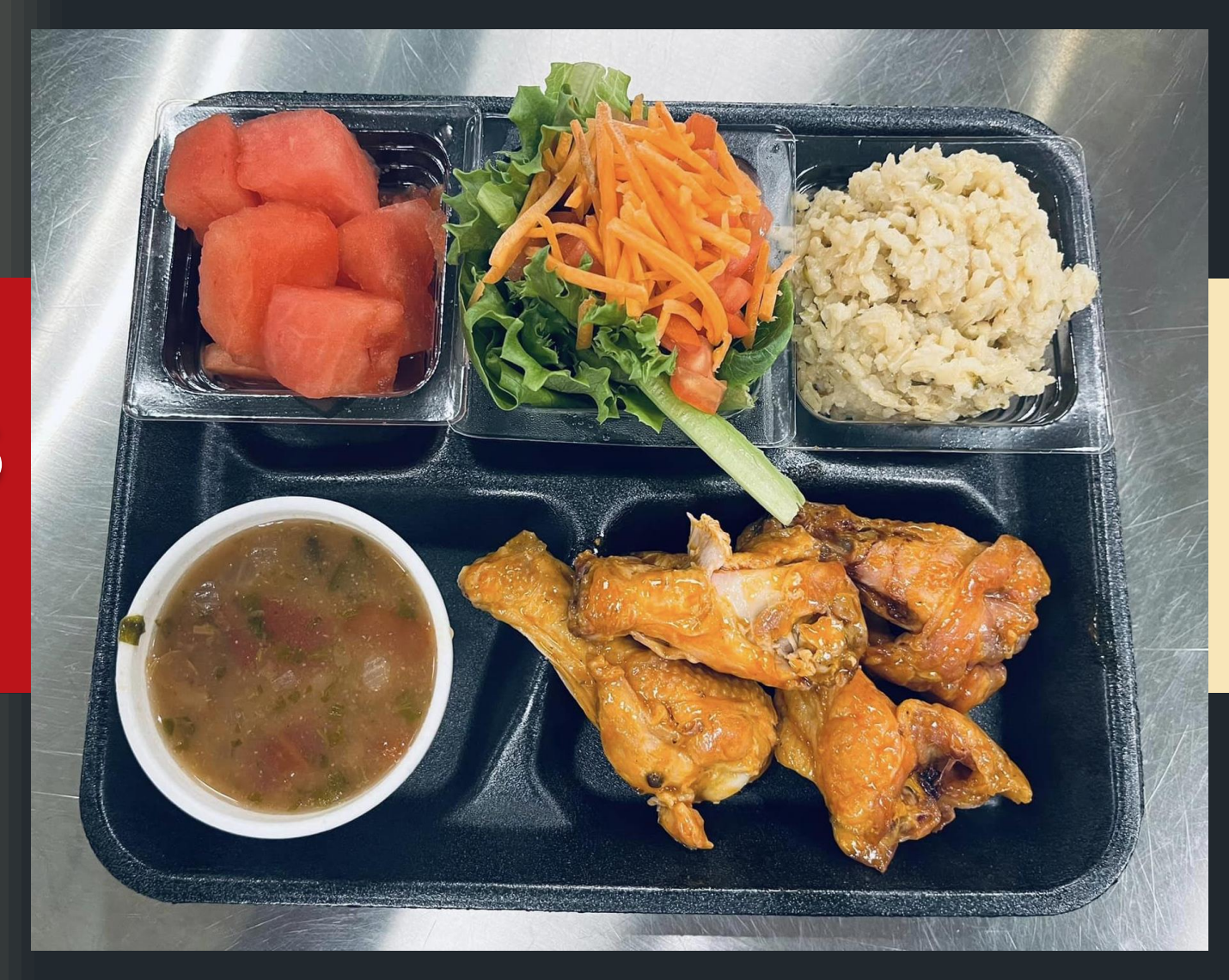
Manor ISD – Greener Pastures Chicken