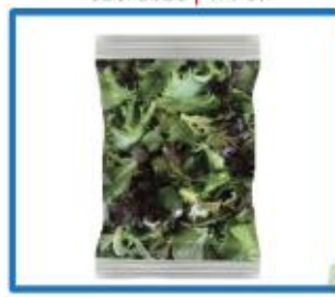
Trueharvest One Cut Truemix 980-6667 | 4/1.5 lb